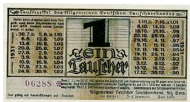
Figure 1: Table money “Tauscher” (issued in Germany 1931)

like iron which will be rusted by the end of the issuance period. It must be difficult and it has never practiced in the past. However, with paper money it is much easier to implement depreciation. The issuer could print a time table on the backside of the note with the dates of depreciation of the nominal value. This way every user (payer and payee) can check the value of the note at the moment of usage for payments. This kind of “table money” is not very convenient, because the payer and payee have to solve the problem of change. They need a different medium of payment with lower value denominations, based on the incremental amount of the depreciation rate. Within a CC environment this problem was usually solved by using the small-value coins of the state-issued money. The table money concept is based on an ongoing depreciation of the nominal value of the note.