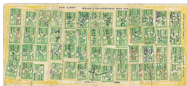
Figure 2: Front –and backside of the scrip issued in Mason City (1933)

In Santa Cruz and Mason City the value of the stamp was 2 cents, so the fee was 2% of the nominal value of the one-dollar-scrip. After 50 (or 52) transactions the scrip had to be redeemed at the issuer for one “real” US dollar. In Ok-